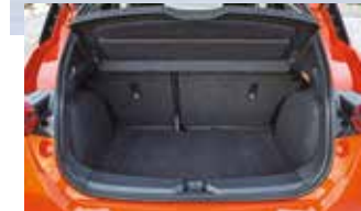
Loads of boot space

Storage isn't a problem in the all-new Nissan Micra's cabin, either. The glove box can take a 2 litre thermos, and 1.5 litre drinks bottles can be slotted into the door bins at the front. What's more, there are two cup-holders positioned in between the front seats and another one at the back. But, it's not all about practicality - the Micra has supportive seats and factory-fitted air-conditioning for true driver comfort.